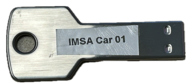
Figure 2: Ford Performance USB Drive.

The file should be copied to a USB thumb drive supplied by Ford Performance (FP) with the car door number clearly written on it and shared with FP engineering support after each required session.